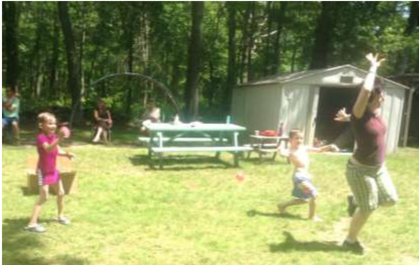
Water Balloon Wars