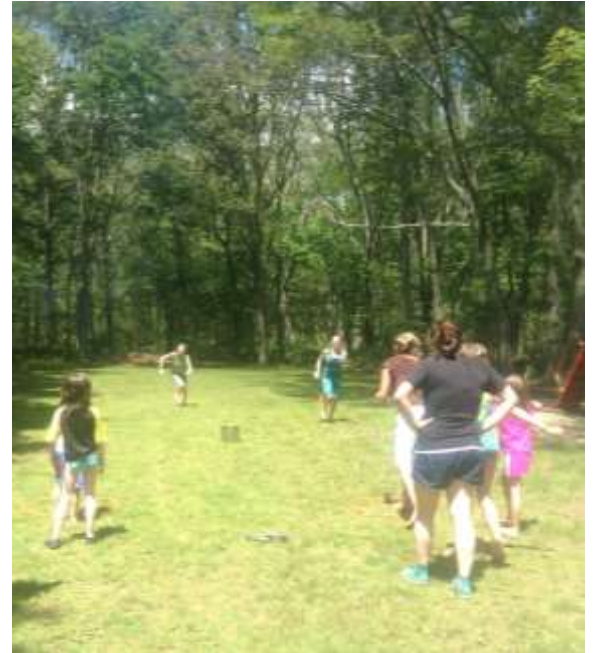
Water Relay Race