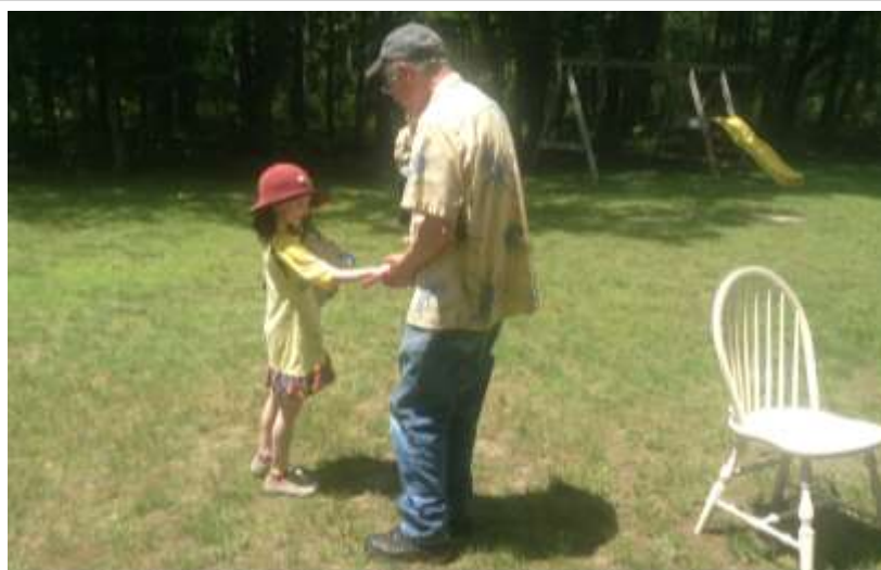
Honoring the world's best history teacher