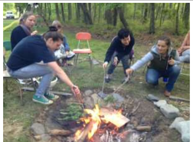
Roasting kale over an open fire

The June "Where is this" was a close up of the green light inside the Sandy Point Lighthouse.