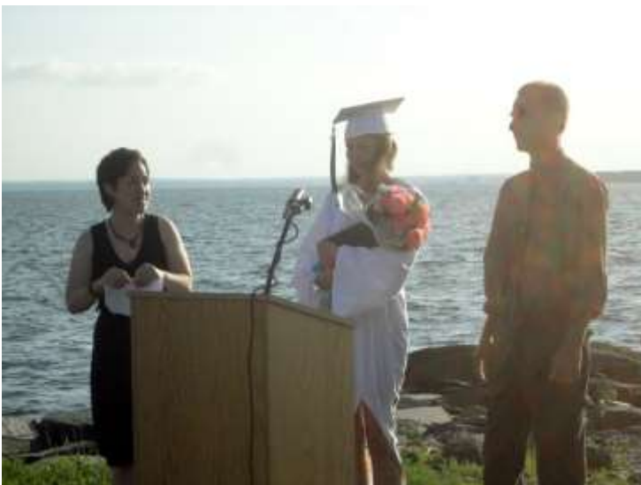
Accepting her diploma