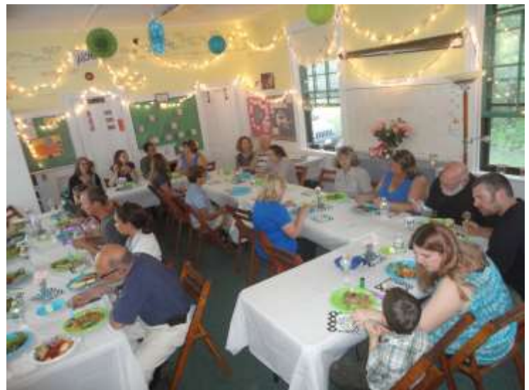
Graduation dinner at the schoolhouse