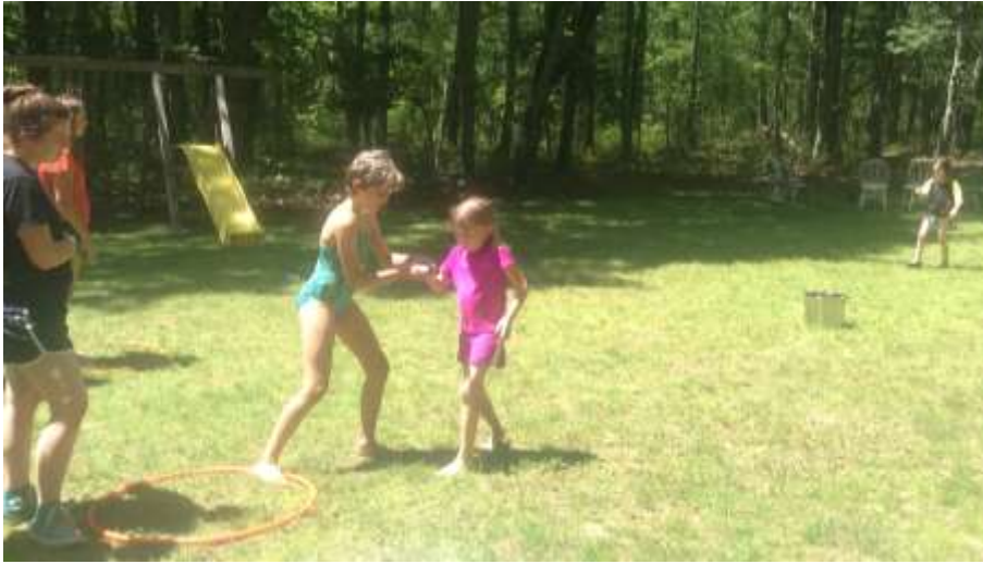
Marshmallow Relay Race