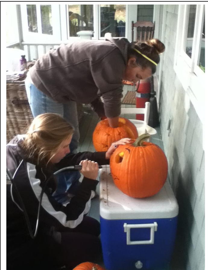
Advanced pumpkin carving