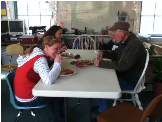
Our Cultural Celebration Feast