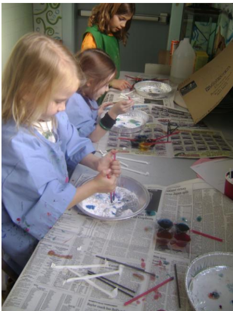
Chemistry color experiment