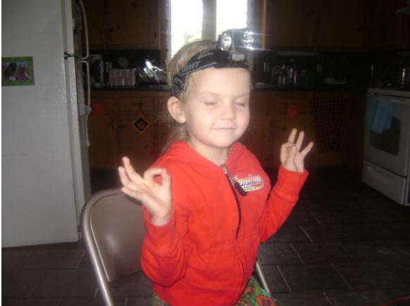
Meditating during the our hurricane class