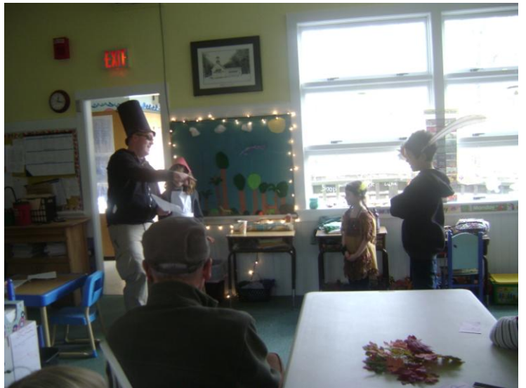
Our Thanksgiving play