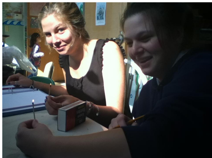
Exploring physical and chemical changes