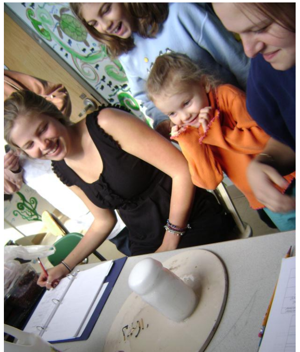
Exploring chemical and physical changes during chemistry class