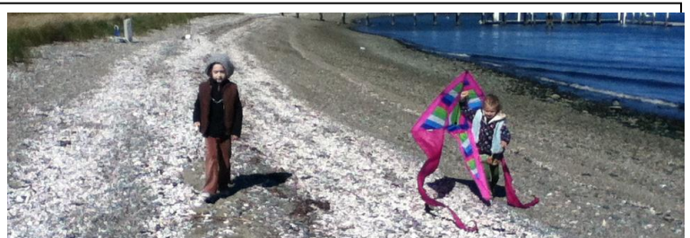
Studying the wind at the beach