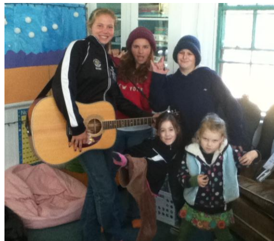
Rock stars with their new guitar