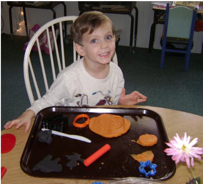
Memphis making home-made play dough pumpkins